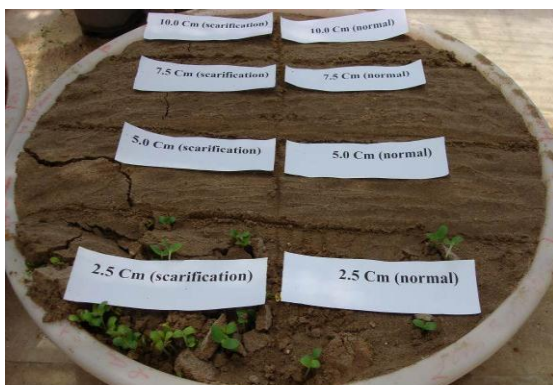
Fig. 5. Effect of seed sowing depth on Smirnovia iranica seed germination (13 days after seed sowing)

Although the main objective of this experiment was to show the depth effects on seed germination and seedling growth, the effects of seed scarification on seed germination and seedling growth was also evaluated. The best seed sowing depth for seed germination was 2.5 cm in scarified seeds (Fig. 5). Although seed germination and seedling growth in Control (non-scarified) seeds were observed, the number of seedling was significantly lower than those of the scarified seeds. Seeds of the 5.0 and 7.5 cm sowing depth germinated and developed to seedlings in a longer time (20 and 25 days, respectively). However, in 10 cm sowing depth, germination was longer and the number of the germinated seeds and seedlings was significantly low.