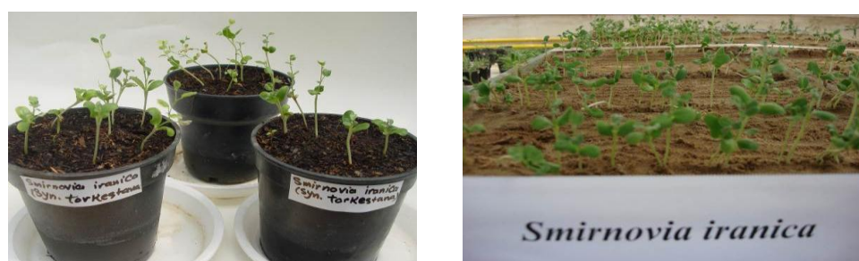
Fig. 2. Smirnovia iranica seeds germinated and developed to seedlings into pots (left) and glass box (right) under greenhouse conditions

sown in 4 different dates from 2007 to 2009 (see Materials and Methods), only the seeds sown on 7 th December 2009 were germinated and continued to grow. The germinated seeds were developed to normal seedlings in spring 2010 (Fig. 3, Middle). In early spring, the seedlings were thinned to 1 plant per pit (Fig. 3, Bottom left). Only a few seedlings were grown into young normal plants (Fig. 3, Bottom right). Although the number of the established plants was low (approx. 5%), the results looked promising.