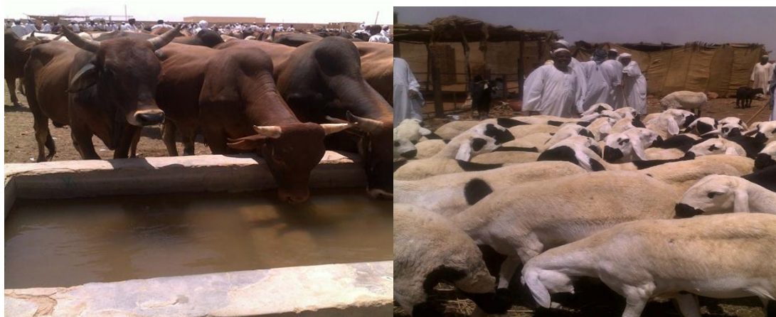
Fig.1. Type of Cattle and sheep in the Eddamar market during field survey 2011

welfare of a large number of poor Sudanese by serving as a source of food, store of wealth, source of revenue, mode of transport, and aid to crop farming. Livestock are also central to the identities and beliefs of many Sudanese tribes (IGAD, 2007). The Butana area is a major rainy season grazing area in eastern Sudan where pastoral livestock communities arrive with their animals from a number of neighboring states to graze their animals and access markets. Poor market infrastructure and services such as rough roads especially in the wet season, shortage of forage and water, small market space, poor fencing, poor/few slaughter houses, limited credit services for traders, high market transaction costs and fluctuating prices, all affect structure, conduct and performance of the markets in the study area. There is different type of cattle and sheep in the study area (Fig. 1). The objective of this study aims to analyze the structure, conduct and performance of livestock markets in the Butana area, Sudan.